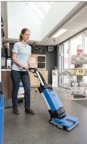
Clark MA10/12E Micro Scrubber