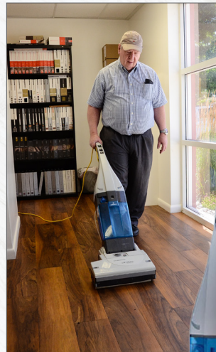
Lindhaus LW38 upright Scrubber 14"